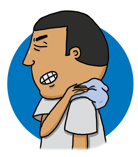
Bub may say their shoulder hurts, use a heat pack this might help with pain