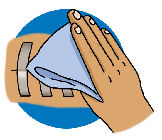
Bath and shower normallypat dry the Steri-Strips. Do not pick them off, they will fall off.