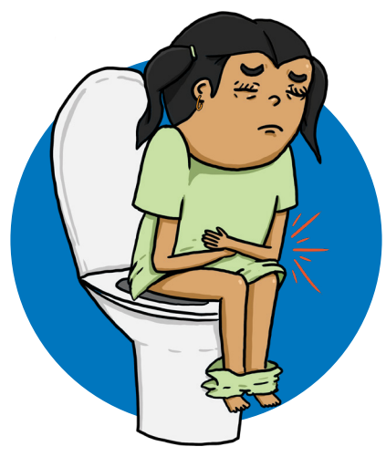
Watch bub for signs of constipation - fluids can help with this