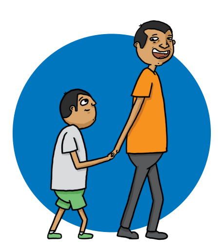
No sports for 2 to 3 weeks just gentle walking and slowly do more activities