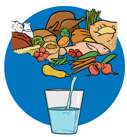
Normal food and lots of water