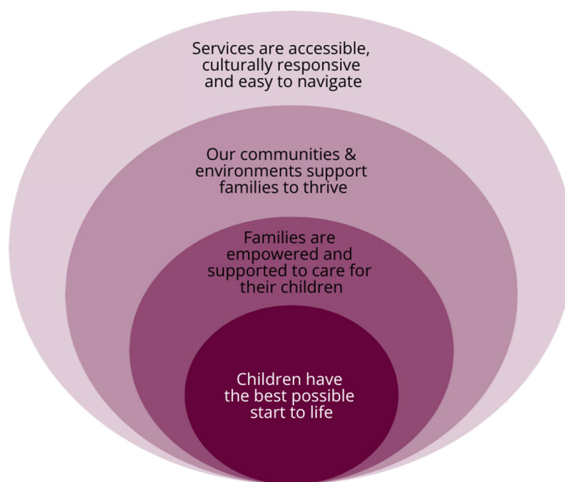
Figure 2: Draft ecological model of the WA First 1000 Days Framework draft Focus Areas.

Through this consultation, we have identified four draft key focus areas as illustrated below: